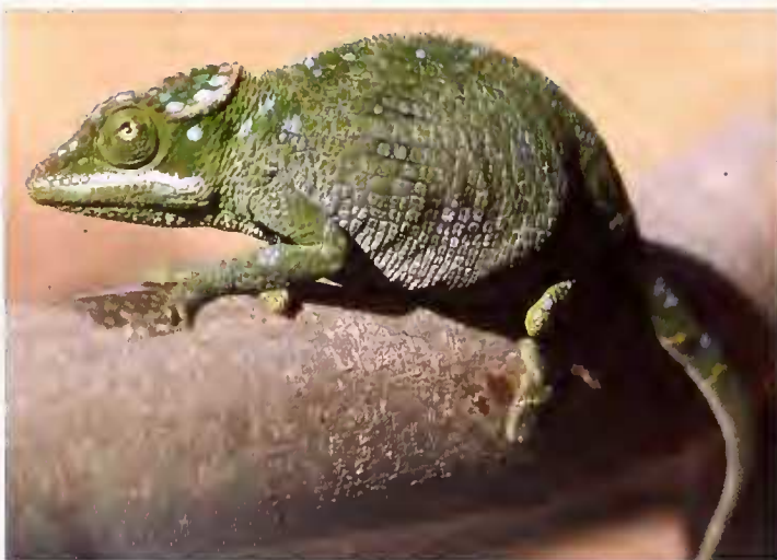
Fig. 7. Female paratype of K. u. arytior ssp. n. in life.

Nevertheless, there are pronounced morphological differences between the Ngorongoro and South Pare specimens and the specimens from the type locality on Mt. Hanang (Müller 1938). These are sufficiently distinct to justify their description as a new taxon. This is similar to the situation where K. boehmei was originally described as a subspecies of K. tavetana (Lutzmann & Necas 2002) and later elevated in to full species rank based on genetic divergence from all other two-horned chameleons (Mariaux